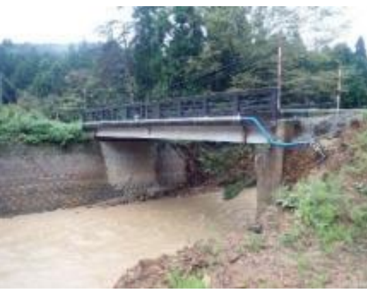
Munesue Bridge damaged by the September downpours