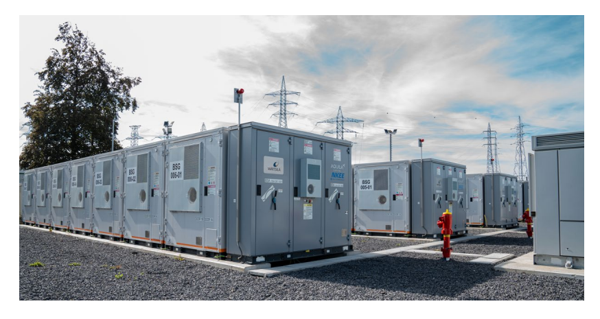
Ruien Energy Storage